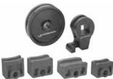
Shoes + forms kit

The angle can be adjusted manually. ROBEND 3000 adjusts easily to any angle between 0- 180°C. Perfect to repeat identical angles. Reduce bending time. Patent requested.