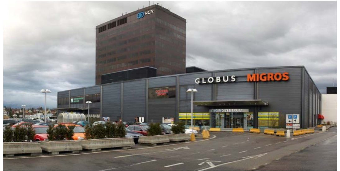
Migros supermarket in the Glatzentrum shopping centre, Zurich