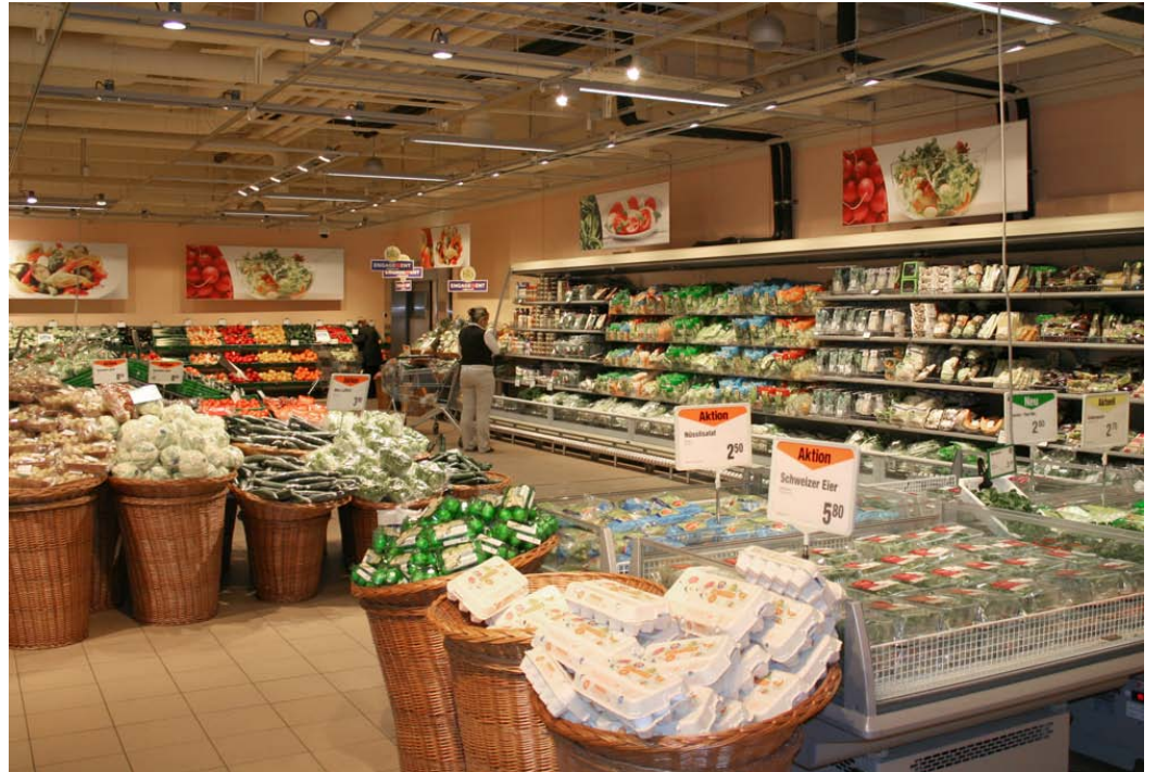
Migros supermarket - fresh food area with refrigerated cabinets