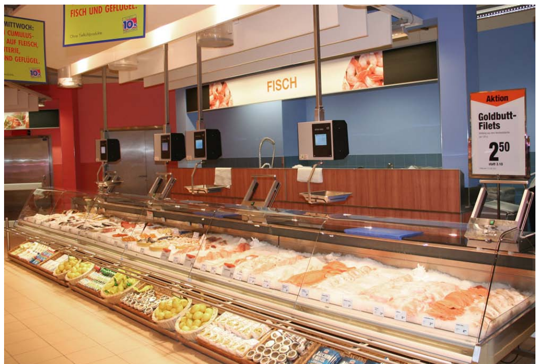
Migros supermarket fish counter