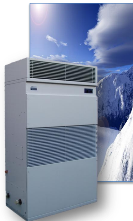
Illustration depicts unit with plenum and grille discharge